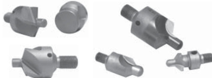
REF. # 55370