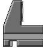
OFFSET PROJECTION STYLE "D"