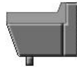
PROJECTION STYLE "K"