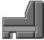
EXTENDED PROJECTION STYLE "D"